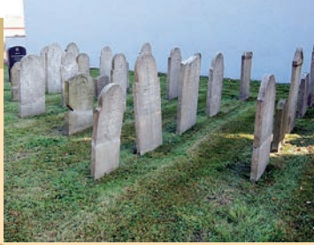
Velké Hoštice Sudice Hlučín